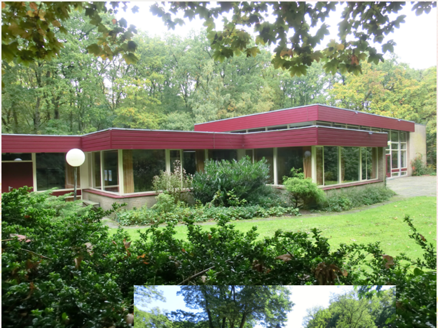
Besant Hall and Library.